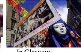
In San Salvador