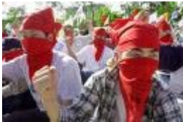
In South Korea