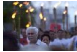
In San Juan