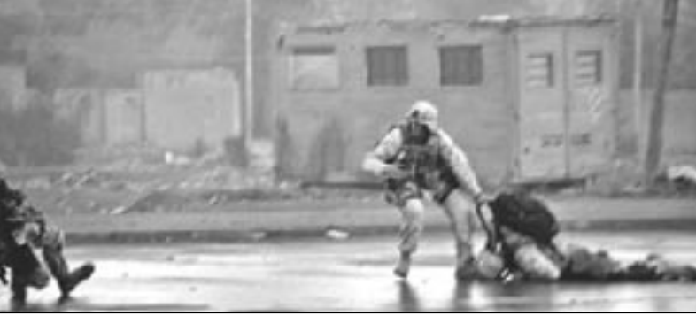
A sniper attacks US troops in Fallujah.

advertising techniques to draw in the desperate. Promises of job training and benefits combine with images of power in which the protagonists are proud and determined young people of all colors, presenting the impression that the military can offer the dignity missing from the lives of the poor. In addition, the Pentagon targets specific ethnic and racial groups among the exploited with more pointed publicity. An example that exposes the kinds of methods used can be found in the recruiting campaigns aimed at poor Latin American immigrants within the US.