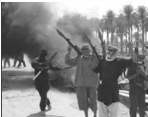
Iraqi resistance fighters.