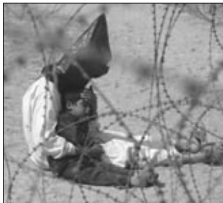
Iraqi prisoners being detained by Coalition forces.