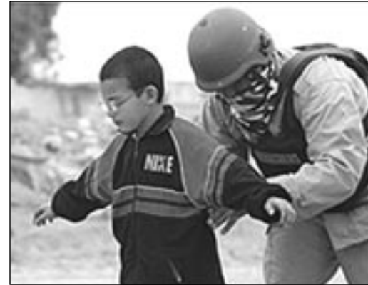
A child undergoes a search in Fallujah.

structures. When social revolution pounds on history's door with all its might, the gangs of exploiters choose to forget their immediate interests, for a time, of course, and rally behind the faction that is most capable and well-equipped for defending capitalism. The global state is precisely this process in motion, always in gestation, that breaks up and establishes itself increasingly more powerfully, expressing the organization of capital in a dominating force, in the force of exploitation that has a greater and greater need to impose its social order in every part of the world, monopolizing violence and keeping it in the hands of the ruling class. The greatest worry of capital's global state is that the permanent catastrophe that it generates will unfailingly provoke violent, armed, uncontrolled reactions ... that it must continually attempt to smother in order to maintain its rule. The difficulty of reasoning in terms of individual countries in such situations is clear, because the reality of this process often surpasses the commonly acknowledged division