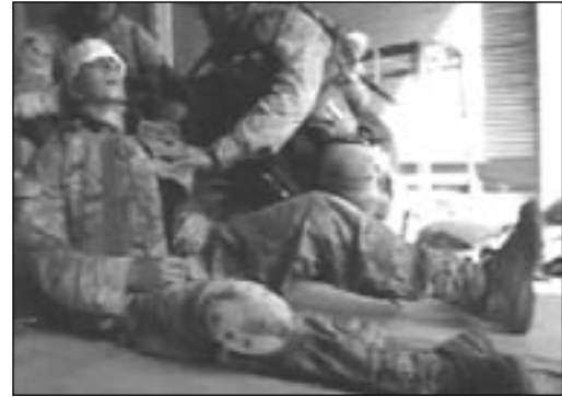
US soldier wounded in Fallujah.

IN MANY WAYS THE CONDITIONS TODAY ARE QUITE different than in 1991, but now like then, the Coalition forces are facing the realization of their worst nightmare in Iraq. The current resistance is shattering all their projects of pacification. More than a year since the capture of Baghdad, continuous attacks, acts of sabotage, arson of oil pipelines and plants, ambushes and kidnappings at the expense of the men recruited for security (a true private army of about 15,000 mercenaries, with a turnover of tens of billions of dollars) certainly don't provide the best terrain for the affairs of multinationals. Before packing his bags to leave, a director of a multinational oil company declared, "Security, the first prerequisite for reconstruction and investment, is lacking." This statement expresses the common concerns of the various jackals that came around after the bombings to plunder the resources of a population already reduced to misery by a decade of UN-sanctioned embargo. Several multinationals have thus been forced to