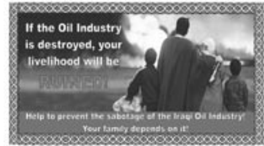
Coalition psychological warfare leaflet.