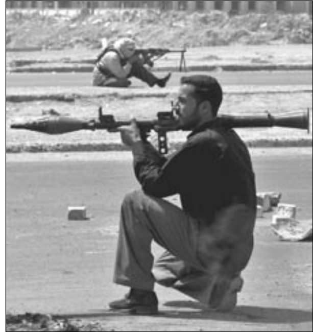
Iraqi soldiers refused to die for the Hussein regime yet retained their weapons after deserting the army to return to their families.

What no army could have done – i.e., making things difficult for the greatest military power in the world – a social guerrilla struggle is managing to do. From the attacks against military convoys to those against embassies and general headquarters, from the assaults against the new Iraqi police to the sabotage of pipelines and refineries, from the lynching of marines to mass strikes, now no one can swallow the lie of a population that loves the “liberating and peace-bringing” soldiers. No one who has a minimum