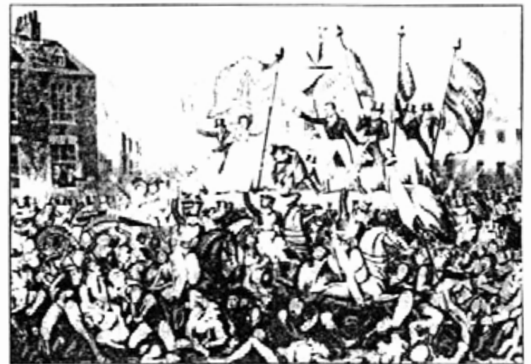
Émeute luddiste à Manchester. 1819.

« Tous les lundis ils s'en font une fête, et le mardi ils ont mal à la tête ; le mercredi ils vont changer leur pièce, et le jeudi ils vont voir leur maî- tresse ; le vendredi ils travaillent sans cesse, le samedi la pièce n'est point faite. Et le dimanche il faut de l'argent, maître. » (Chanson populaire gasconne.)