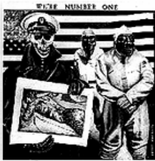
U.S. planning to win atomic war

From the 1960s the Soviet economy was opened up to Western Capitalism and this penetration of Western capital increased during the 1970s. The development of the international division of labour in the 60's and increase of international exchanges helped influence certain sectors of the bureaucracy to push for 'reforms' to 'liberalise' the economy. If Gorbachev had not existed, it would have been necessary to invent him! Already integrated within the world economy, the Soviet countries