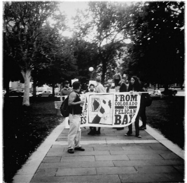
Hunger strike supporters marching through the park in front of the capitol building and garnering support from the #occupydenver encampment.

During the solidarity picket, approximately two dozen people handed out fliers and held banners and placards while cars honked in support. Picketers then marched through the Occupy Denver encampment chanting "Fire to the Prisons" and "No More Cops, No More Hate, Smash the Prisons, Smash the State." Although there has been some tension between longtime local anarchist organizers and the seemingly