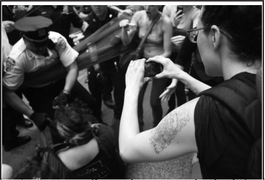
An #occupywallstreet demonstrator has her hair pulled during a police assault.

once demonstrators nearly 40 protesters violated Denver’s city code for sleeping out- A general assembly was doors, the protest has due to be held on Tuesday the 27th at 7pm. so far not emulated other cities’ examples of an occupation. the protest claiming to be on the ground stated information sent to Ignite!’s that more people need twitter feed on the 24th, to show up and that more cover-