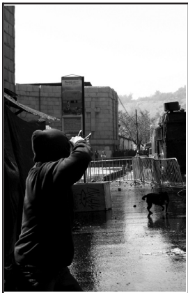
A Chilean streetfighter takes aims at police with a slingshot