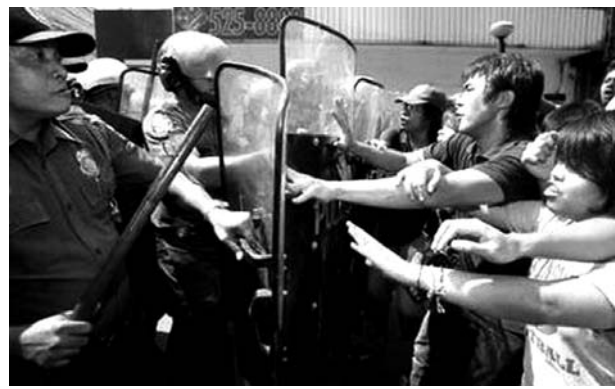
Manila, Philippines—June 2008

Insurprisingly, the U.S. bourgeois has selected a head of state with a knack for reassuring them that everything is going to be fine. (Expect to see many more silvertongued liberals in high places soon, particularly Iceland and perhaps France and Greece.)