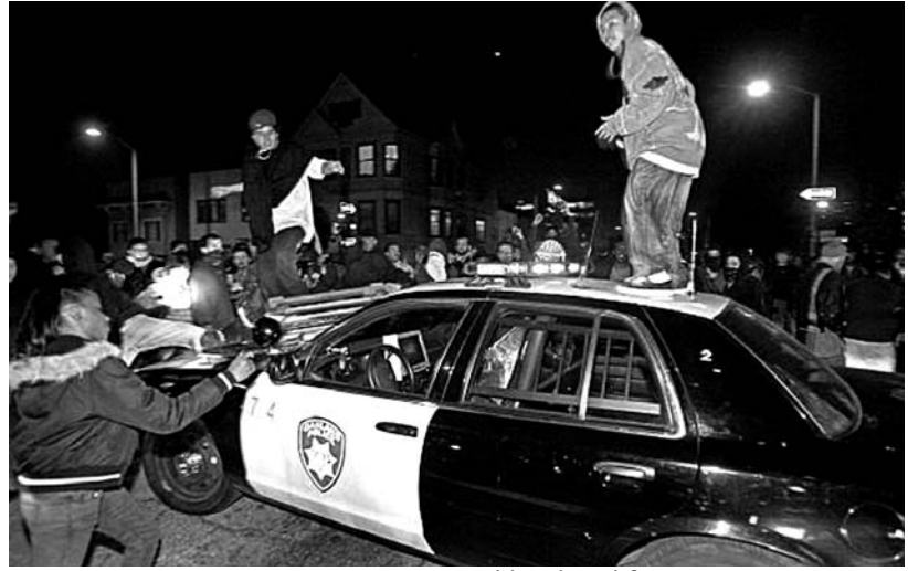
Oakland, California—January 2008

About 7½ years ago, this phase of capitalist restructuring—which had provoked resistance throughout the world, particularly the West and the Global South—came to an end and was replaced by a more forceful, nationalistic, warmongering period around the world—the "War on Terror" of the global bourgeoisie. But the war machines, not surprisingly, have become bogged down, and so has the economy that depended on them. A number of risky investments went very badly, and now the responsible ruling class is escaping with massive hand outs drawn from public funds. We are getting stuck with the bill, in the form of social spending cuts, rising unemployment, and in many parts of the world, shortages of basic necessities such as food and fuel. This "crisis," which is really just more business as usual, has also given momentum to a new cycle of resistance and repression, this time on a truly global scale. We are supposed to keep busy fighting each other for the crumbs from the master's table. But we are also capable of flipping the whole damn table over.