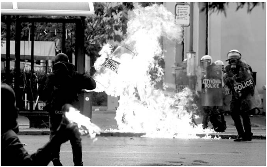
Athens, Greece-December 2008

There are some who would replace capitalism with what they call a "higher" form of social organization. But we don't need to replace capitalism or the class system, any more than we need to replace a brain tumor. The only common element of our class identity is our exploitation and lack of control; so we are united only in our negative project of destroying the economy which requires our exploitation, and the states and other hierarchal structures which enforce it. We fight to do away with class—then we will live as we see fit.