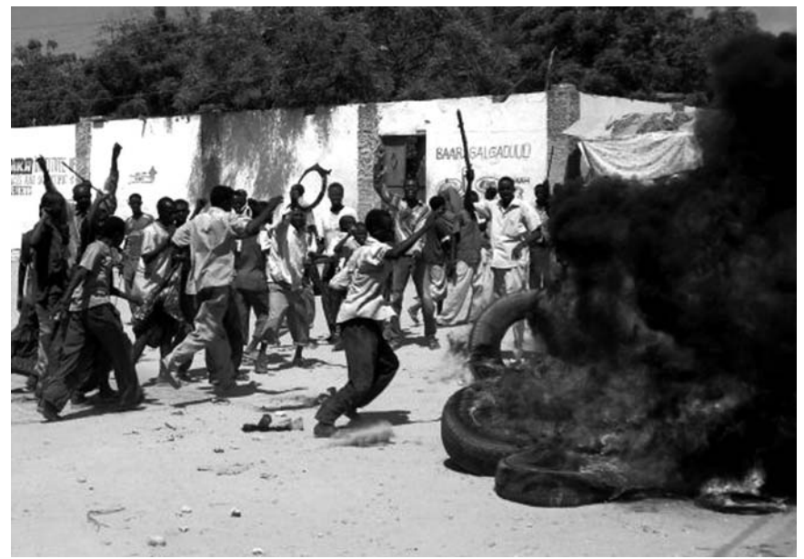
Mogadishu, May 2008

Solidarity to all ungovernables, and fire to this world. March 2009