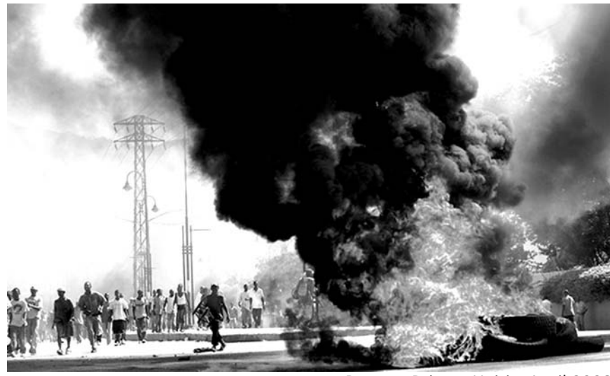
Port-au-Prince, Haiti—April 2008

It's hard to know where to begin this story, as it concerns stituations exploding right now around the world, as well as thousands of years of class struggle, cycles of conflict and accumulation which make up so much of what we know as history. Hard times in the economy of the rich means political attacks on the common people. It is a moment where social and technological "progress" could provide the means to extract more profit by separating us from our survival in new ways. But it is also a moment when counter-attack against the ruling class could bring about total social change—a revolution in which all the existing system's defenders like institutions, cops, commodities and money will be swept off the field.