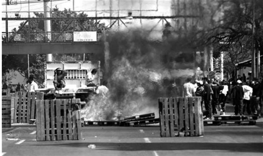
Monterrey, Mexico—February 2008

they were losing their grip on "public" space to hungry, angry, leaderless mobs. Bread or Blood is a threat, not a question. How do we gain leverage? We carry out our threats—or at least enough of them to make the bosses fear the power of our class; to remind them they are outnumbered and cowardly. And as the second banner slogan suggests, we can use public action to communicate and find solidarity with our peers, rather than to communicate political messages to politicians. We could create situations in which to act as a social force on behalf of our own well-being —and against all management and all political relations.