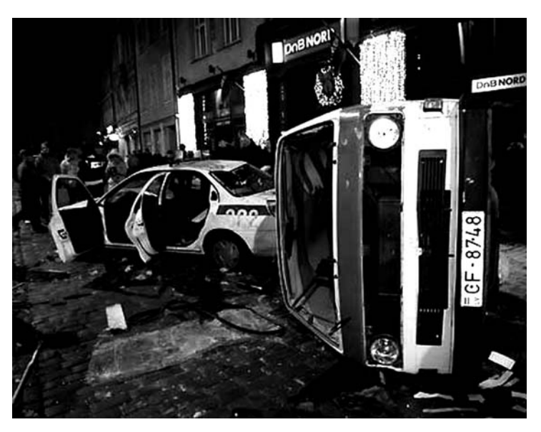
& the potential for revolution