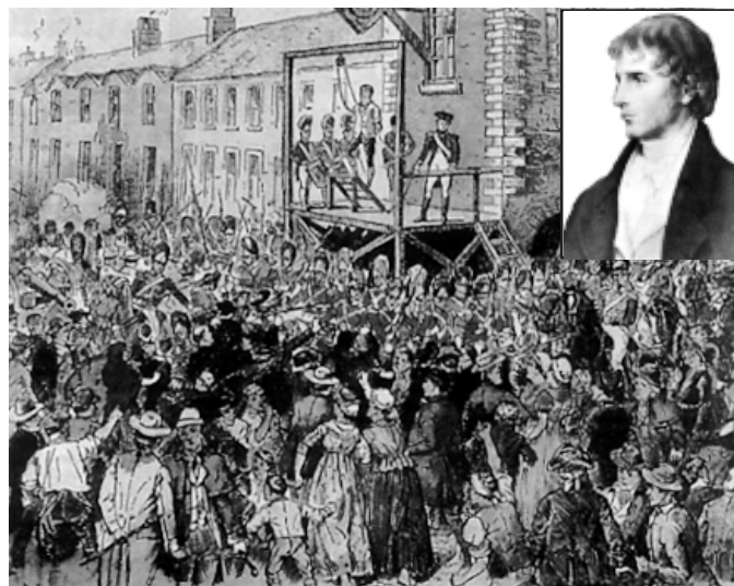
Execution of one of the Protestant leaders of the rising, Henry Joy McCracken (inset) in Belfast