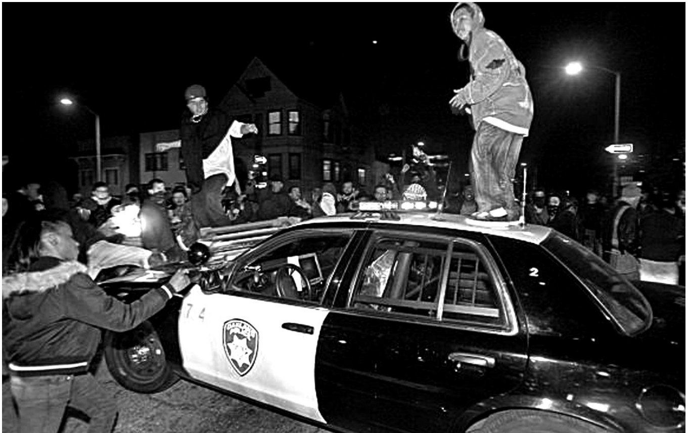
Oakland, California—January 2008

This process could be seen at work in the Oscar Grant riots in Oakland, where a gathering of people to protest a police murder wound up unleashing a much broader current of rage, against stores, cars, and ruling class-imposed order in the city itself, followed by a full week of nights of social conflict both open and clandestine. Or in Greece, where much better-established self-organized anti-authoritarian communities went on the offensive during a similar moment of outrage, and in its wake, many thousands of youth and “ordinary people” not only participated in street fighting but began to take control of their schools, workplaces and neighborhoods. Oaxaca in '06 would be another recent example. The point is that society is like a piece of fabric with a tear in it, and if someone pulls on either side of the tear, the whole thing could be torn apart.