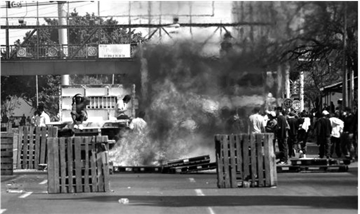
Monterrey, Mexico—February 2008

they were losing their grip on “public” space to hungry, angry, leaderless mobs. Bread or Blood is a threat, not a question. How do we gain leverage? We carry out our threats—or at least enough of them to make the bosses fear the power of our class; to remind them they are outnumbered and cowardly. And as the second banner slogan suggests, we can use public action to communicate and find solidarity with our peers, rather than to communicate political messages to politicians. We could create situations in which to act as a social force on behalf of our own well-being —and against all management and all political relations.