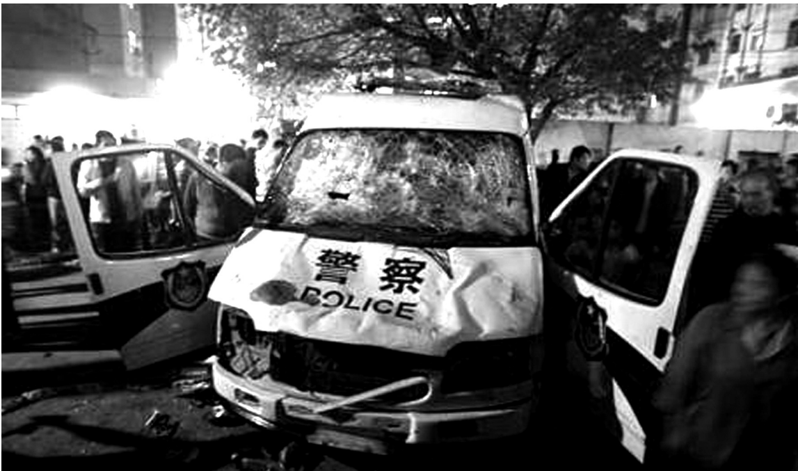
Dongguan, China— November 2008

As Os Cangaceiros (rebels against the French prison system expansion of the 1980s) observed, “Hooliganism is an immediate expression of dissatisfaction.” If there is misery to be found in work, and the world that forces us to work, there is joy in destroying it. These interruptions communicate nothing beyond themselves: bodies manifesting their desires in violence against the most sacred foundations of our social order, property and the rule of law. Consider how often cars are flipped, smashed, or set alight, showing up in so many news photos like temporary monuments of revolt, the only monuments the working class has or will ever erect for itself. The omnipresence of the car in modern society, its domination of space, its stinking exhaust, its vacuum-like effect on wallets: one of the great democratic, technological wonders of the modern age seems to be nothing but a magnet for proletarian fury.