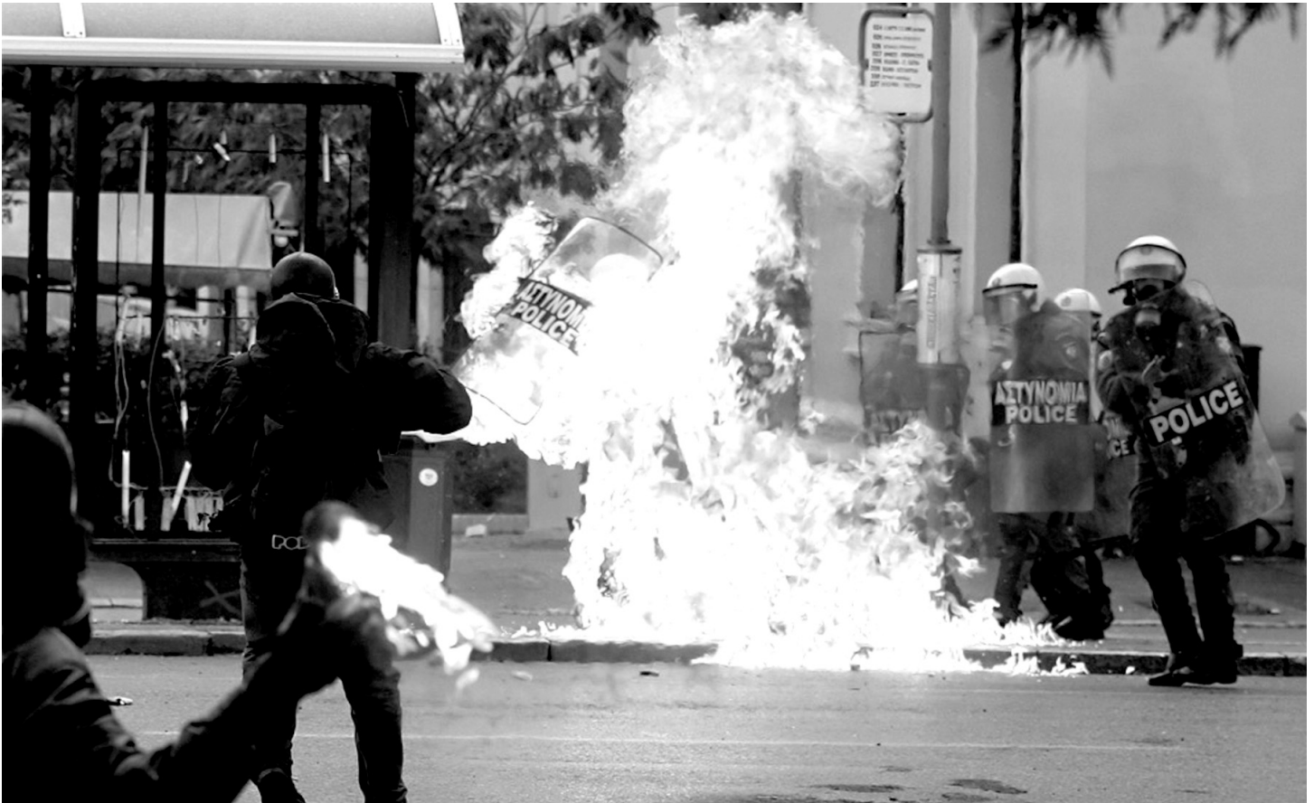
Athens, Greece—December 2008

There are some who would replace capitalism with what they call a “higher” form of social organization. But we don’t need to replace capitalism or the class system, any more than we need to replace a brain tumor. The only common element of our class identity is our exploitation and lack of control; so we are united only in our negative project of destroying the economy which requires our exploitation, and the states and other hierarchal structures which enforce it. We fight to do away with class—then we will live as we see fit.