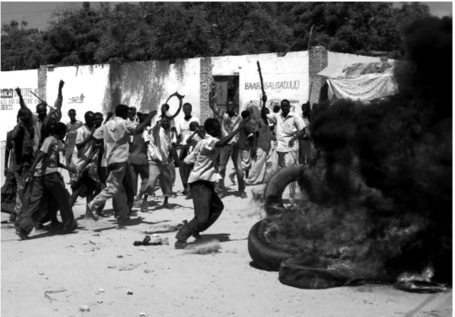
Mogadishu, May 2008

Solidarity to all ungovernables, and fire to this world. March 2009