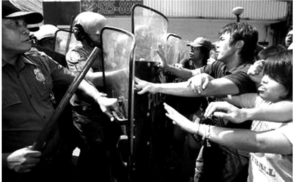
Manila, Philippines—June 2008

Unsurprisingly, the U.S. bourgeois has selected a head of state with a knack for reassuring them that everything is going to be fine. (Expect to see many more silver-tongued liberals in high places soon, particularly Iceland and perhaps France and Greece.)