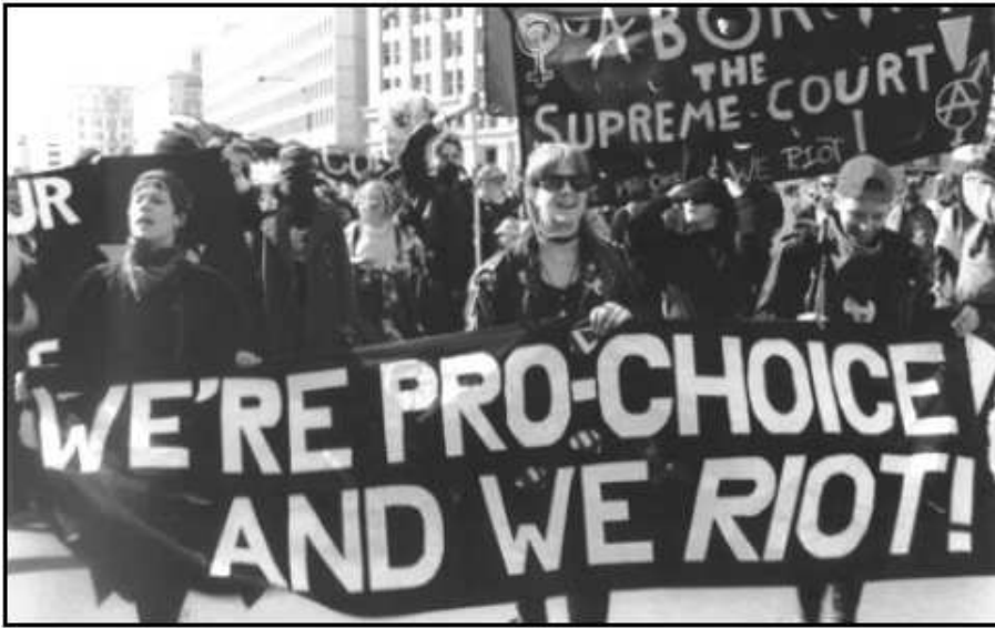
Anarchist contingent at "March on Washington for Reproductive Freedom"

broader social movements became more apparent.