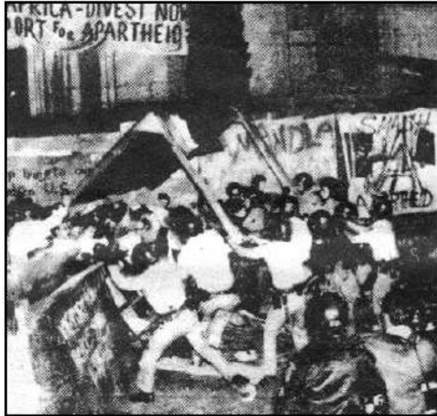
UC-Berkeley divestment shantytown attacked, early 1980s

The third significant element of the divestment struggle was that it exposed the direct complicity of local institutions (like colleges) in the oppression and