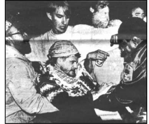
Anarchist unarrest at pentagon blockade

The Pentagon blockade was originally called by the Committee in Solidarity with the People of El Salvador (CISPES) and the Pledge of Resistance as an action against the US support for the right wing Salvadoran government. As at Langley there were two distinct conceptions of the blockade. The New York and Washington DC leaderships of CISPES and the Pledge basically wanted a symbolic civil disobedience and therefore planned a legal rally and a civil disobedience at a single entrance of the Pentagon. The anarchists (taking for this single action the name Mayday Network of Anarchists), the Progressive Student Network, and a number of local CISPES and Pledge groups influenced by the militancy of the Honduras actions wanted to engage in "mobile tactics" blocking access to the Pentagon parking lot and avoiding arrest as long as possible to prolong the actual disruption of work at the Pentagon.