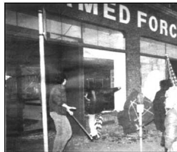
Anarchists attack recruiting center, Minneapolis

On March 17, 1988 the U.S. sent 3,200 troops to Honduras in apparent preparation for an invasion of Nicaragua. The response to this action was massive. In every major city and in hundreds of towns people took to the streets. The actions were militant. In countless cities government buildings or offices were occupied in sit ins. In those cities with strong Central America movements like San Francisco, Minneapolis, Toronto, and Boston demonstrations attacked government buildings, breaking windows and fighting with the police. The demonstrations went on day after day for a week until Reagan announced that the troops would be brought home. In all of the most militant