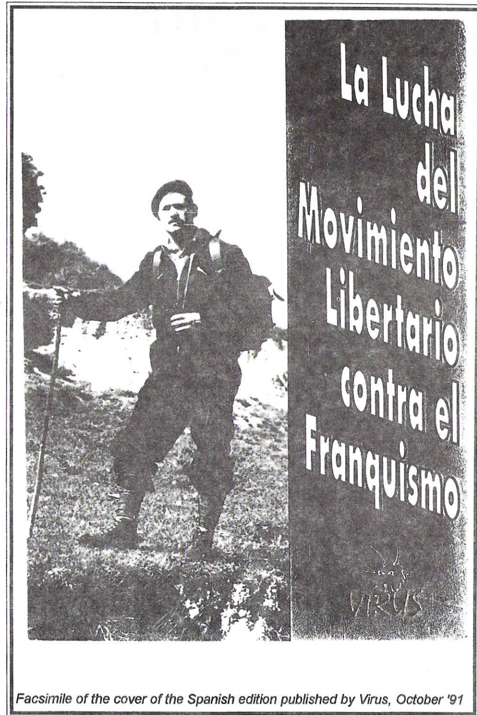
Facsimile of the cover of the Spanish edition published by Virus, October '91