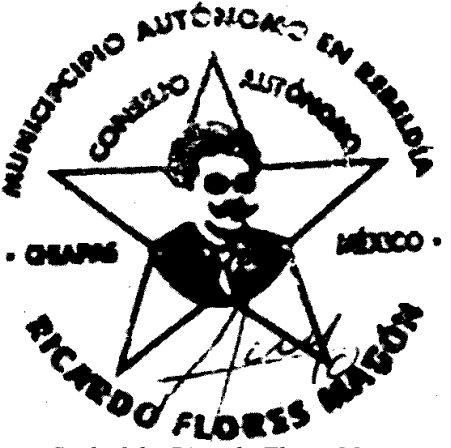
Seal of the Ricardo Flores Magon autonomous municipality

"They'd given us the right to participate in the assemblies and in study groups but there was no law about women. And so we protested and that's how the Law for women came about. We all formulated it and presented it in an assembly of all the towns. Men and women voted on it. There were no problems. In the process opinions of women were asked in all the towns. The insurgents helped us write it," [16]