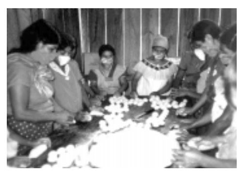
The bread collective in Diez de Abril

This was an early description of the system of delegate democracy in place where the communities could recall their CCRI delegate if they felt they were not representing them. In a major interview with Mexican anarchists in May 1994 Marcos described the delegate system of decision making before going on to outline the limitations on even the CCRI's power to make decisions.