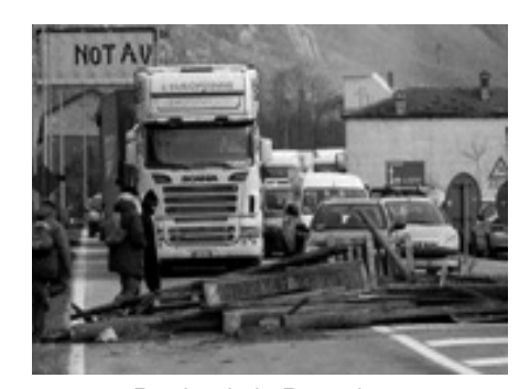
Barricade in Bussoleno

In 2005, construction for the TAV was underway at the mountain sports Olympic venue, Val di Susa. In the winter of 2005, residents of Val di Susa and supporters from many places came together to prevent the TAV by occupying a construction site. Residents