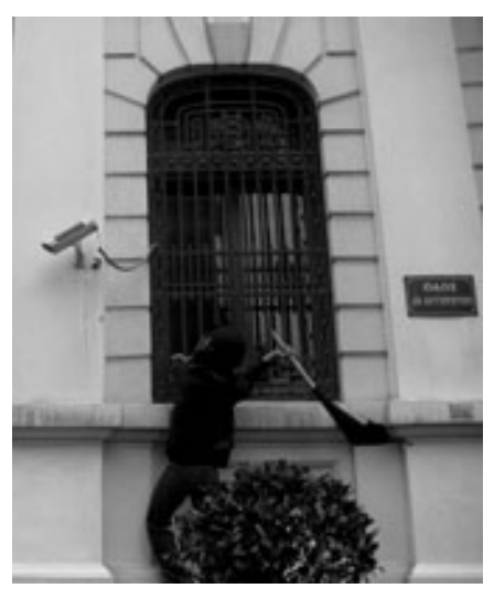
Breaking a surveillance camera Crete, Greece 2008

InFebruary2004, two government burned trucks were using homemade gas canisters during International Olympic Committee meetings in Athens. The claim for responsibility was signed by the Olympic mascots. To complete the Olympics infrastructure in time, work went on non-stop and many foreign temporary workers were hired. In the rush, dozens of workers died. There is no official number. some say up to 150 workers died on Olympics related work sites in Greece.