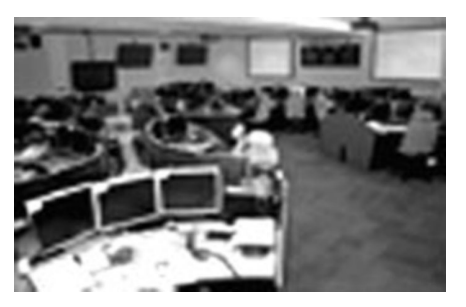
Global Operations Center, Offutt, NE, USA, a Kiewit contract

The injunction to remove the occupiers of the Eagle Ridge Bluffs camp was filed in May 2006 by highway construction contractors