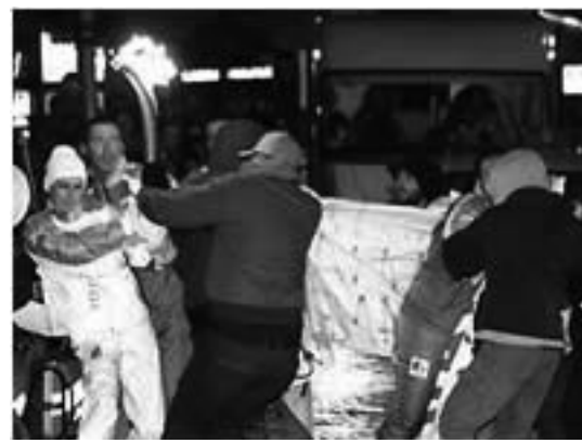
January 2006, anarchists snatch the Olympic torch, Trento, Italy January 2006

The planned route of the Olympic torch was diverted throughout Italy again and again. In Genoa, on December 18, 2005 a blockade forced the flame