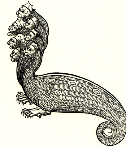
The Hydra, supposed to be killed by Hercules. Edward Topsell, Historie of Serpents (1608).

The strikes, mutinies, separations, and defiances against the power and authority of the sovereign Virginia Company after the shipwreck on Bermuda would play a major, even determining part in the course of colonization, as the subsequent histories of Bermuda and Virginia would show.