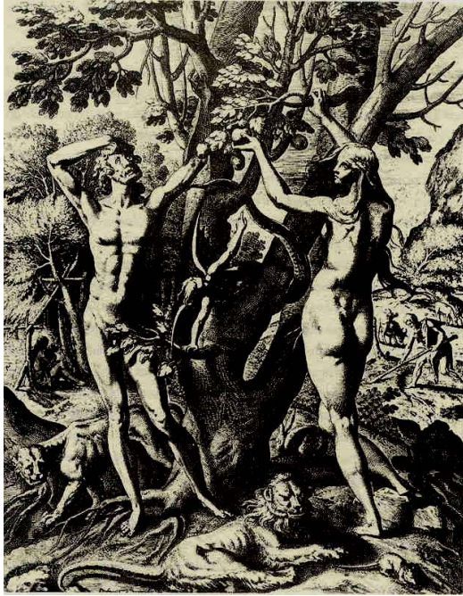
The New World as paradise, by Theodore de Bry, 1588. Thomas Hariot, A breife and true report of the new found land in Virginia (1590).

He concluded that in Virginia, “there is indeed no want at all.” Another Virginia Company advocate knew that such reports were false, that some in England had dismissed them as utopian, but he nevertheless maintained the lie, promising prospective laborers a six-hour workday in which the “sappe of their bodies” would not “be spent for other mens profite.” 6 Many colonists had headed toward Virginia, on the Sea-Venture and other vessels, with the “heate and zeale” of a “romain year of lubile.” The biblical jubilee (Leviticus) authorized the call for an end to bondage and for the return of the commons to the dispossessed. Bermuda seemed the perfect place to enact this biblical prophecy. 7