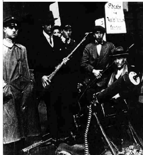
“The soviet is the place of silence” (Brice Parain)

negativity in order to suffocate it, but all that did was free it from mimetic behavior control and make it take to the shadows where free forms of existence can blossom. But the most disturbing aspect of these new people of the abyss – since that’s how they were depicted – was that the critique they were carrying out was above all the affirmation of an ethos that is foreign to the Spectacle, that is, a heretical relationship to lived experience. It appeared that in this section of territory it thought it had gotten squared away, there were recesses where relations were not mediated by it; that in other words its monopoly on the production of meaning was not just being contested but had even been locally and temporarily removed. And it’s clear that those who – and this is a rare event in these “autonomous zones” – succeed in tying together a critique of commodity society and an