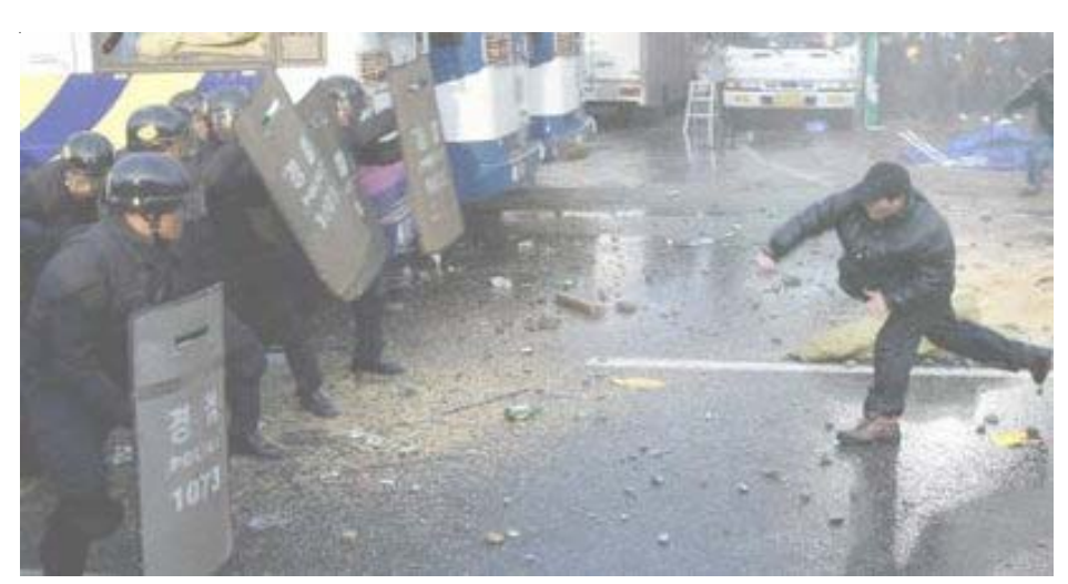
A South Korean worker who knows where class lines stand