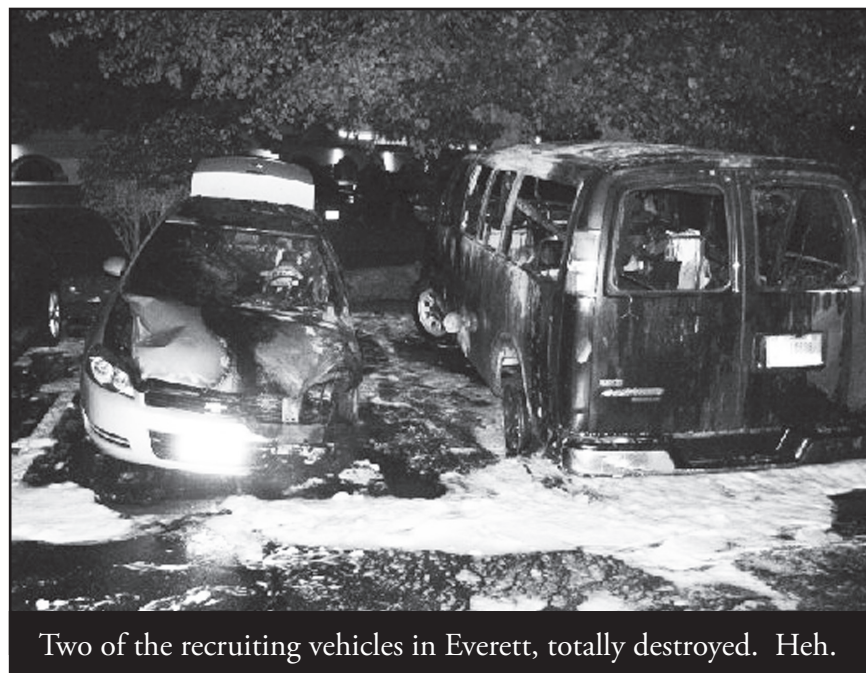
Two of the recruiting vehicles in Everett, totally destroyed. Heh.

The communique was signed "anarchistcrabpplz." The authors of the communique are referring to the General Assembly of Occupy Seattle. With the intention of the movement being to punish the big banks, it is no surprise that some grumpy anarchists took it upon themselves to physically damage a bank. But seriously, anarchists in Fremont? Who knew?