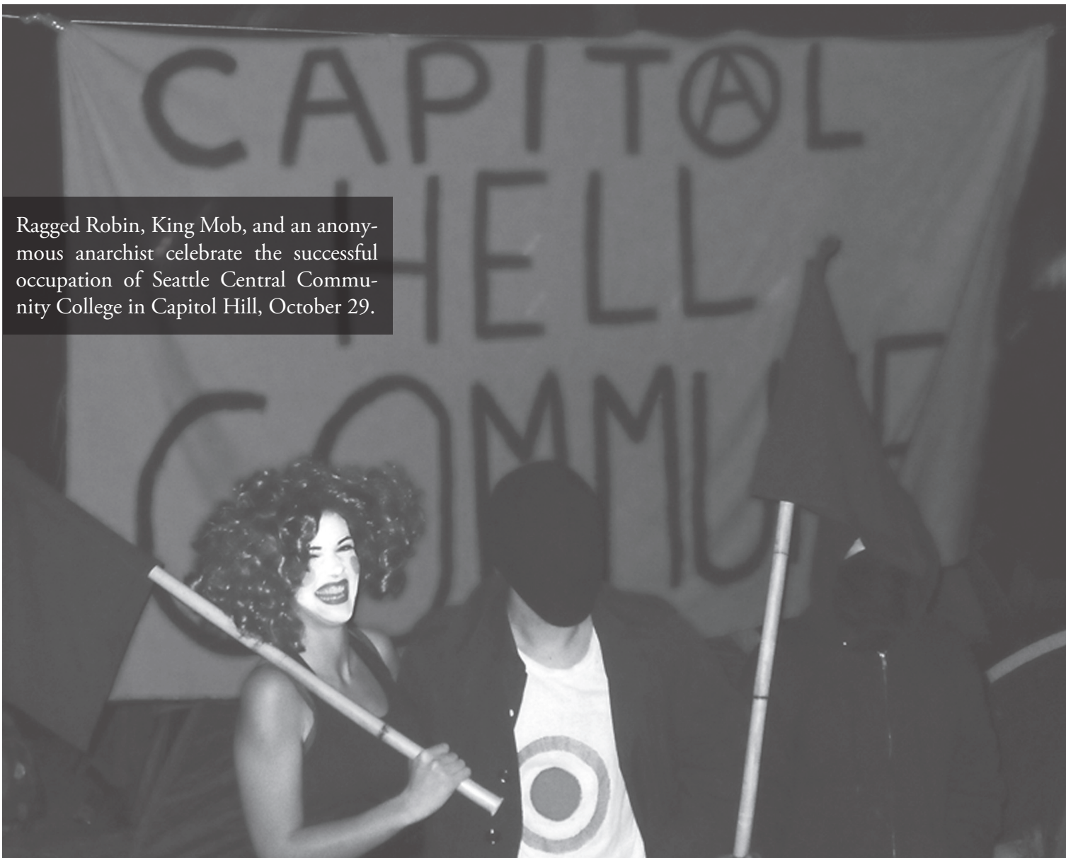
Ragged Robin, King Mob, and an anonymous anarchist celebrate the successful occupation of Seattle Central Community College in Capitol Hill, October 29.

Run, comrade, the old world is behind you!