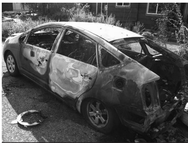
Burnt Toyota Prius on Beacon Hill, September 11th

Taking it to another level, an arsonist burnt three cars in Beacon Hill during the first hours of September 11th. The brightest jewel in this fiery crown is a completely destroyed Prius, the ultimate symbol of green-washed car culture. If there is to be a war on cars, we don't think this arsonist will be sipping cocktails with the Mayor. Hopefully, they'll be burning more cars. 🐦