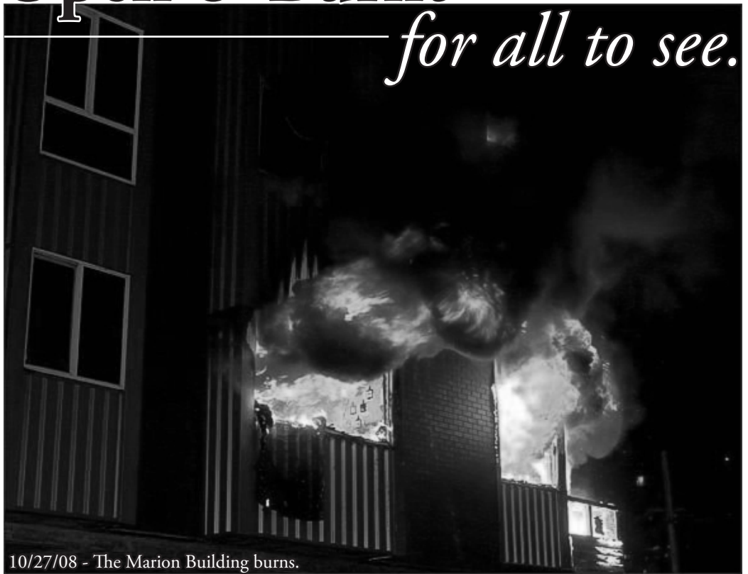
10/27/08 - The Marion Building burns.