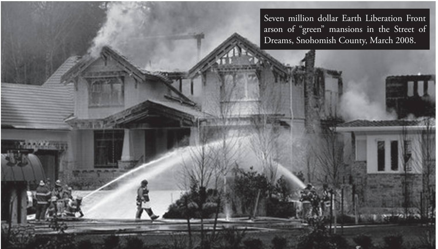
Seven million dollar Earth Liberation Front arson of “green” mansions in the Street of Dreams, Snohomish County, March 2008.

Keeping these two forces separated by a middle class buffer has helped keep conflict hidden under the surface. With the American Dream now crumbling into its own grave, we will see conflicts the likes of which we have only so far glimpsed in places like Cairo, Athens, and London. The worst nightmares of the high capitalists are starting to come true. 🌀