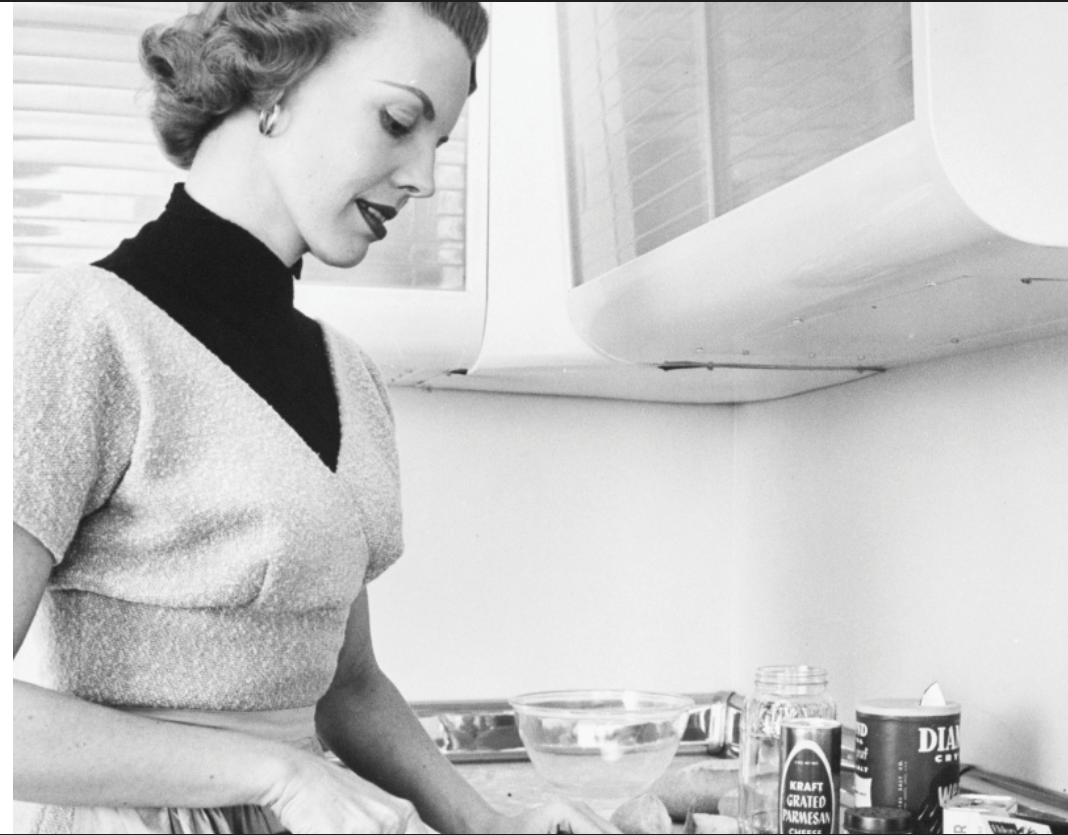
WOMEN AND THE SUBVERSION OF THE COMMUNITY Mariarosa Dalla Costa & Selma James

W E MUST DISCOVER FORMS OF STRUGGLE WHICH IMMEDIATELY BREAK THE WHOLE STRUCTURE OF DOMESTIC WORK, REJECTING IT ABSOLUTELY, REJECTING OUR ROLE AS HOUSEWIVES AND THE HOME AS THE GHETTO OF OUR EXISTENCE, SINCE THE PROBLEM IS NOT ONLY TO STOP DOING THIS WORK, BUT TO SMASH THE ENTIRE ROLE OF HOUSEWIFE.