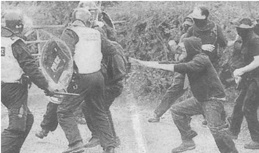
The Filth & The Fury - Militant antifascists move in to de-arrest a captured comrade

The British National Party's annual 'Red, White & Blue' scumfest has seen very little opposition in the past. However, this year, the threat of militant antifascist opposition caused the BNP to be denied a music and drinks license for the event, and it only took place at all because of a huge police presence reminiscent of the National Front's heyday in the 1970's.