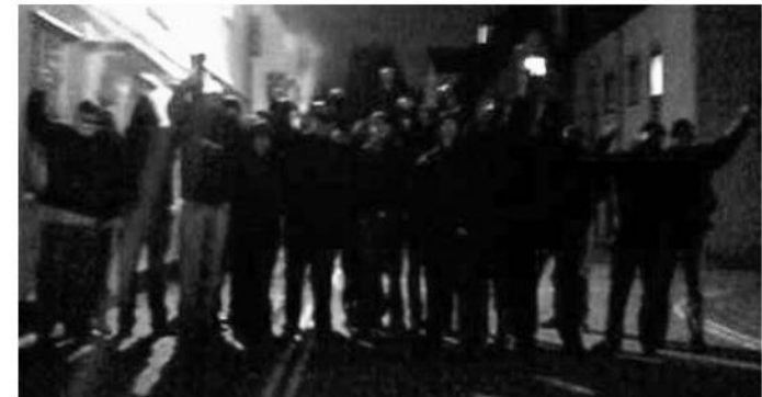
Antifa opposing the BNP in Oxford last year

In the 1930's, the era of the Nazis, fascist movements sprang up across Europe and beyond. In Britain, Sir Oswald Mosley, previously a Labour MP, led the British Union of Fascists, the so-called 'Blackshirts'. Mosley styled himself on Adolf Hitler, and the BUF held Nazi-style rallies and marches where anyone who opposed them was ruthlessly beaten. Just as with the British National Party the BUF were protected by the State (and defended by clueless liberals) under the guise of supposed "free speech." In 1936, amid increasing fascist attacks on their opponents, and growing fascist influence across Europe, Mosley declared that he and his Blackshirts would march through the heart of the Jewish East End. As one, the East End community came out to oppose the fascists and the police who protected them. After fierce street-fighting the antifascists smashed the march and routed Mosley and his Blackshirts. It was a decisive victory in the struggle against fascism. For the most part, today's fascists wear suits and ties rather than black shirts, standing under the banner of the BNP. They remain just as much of a threat though, and must be opposed just as Mosley's fascists were opposed. Today ANTIFA stands in the spirit of Cable St, opposing fascism whenever, however, and wherever it appears, and by any means necessary.