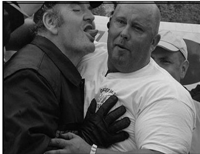
BNP 'Security' - A right bunch of Toilets

STS, 47 Rockingham Close Chesterfield S40 1JE. Telephone 01246 278754 and 07889 832076.